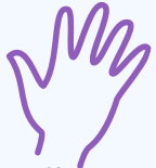
Five finger positivity