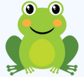
Grounding by sitting still like a frog