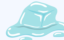
'Melting' muscle relaxation

Please note we highly advise you attend our optional parent workshop to find out more about these and how to support your child to use the strategies. Your school will let you know the details of this.