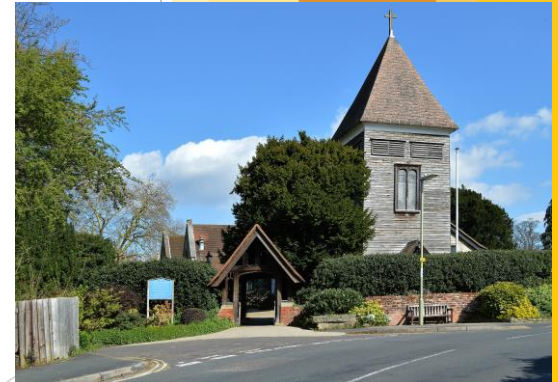
St Peter's Church